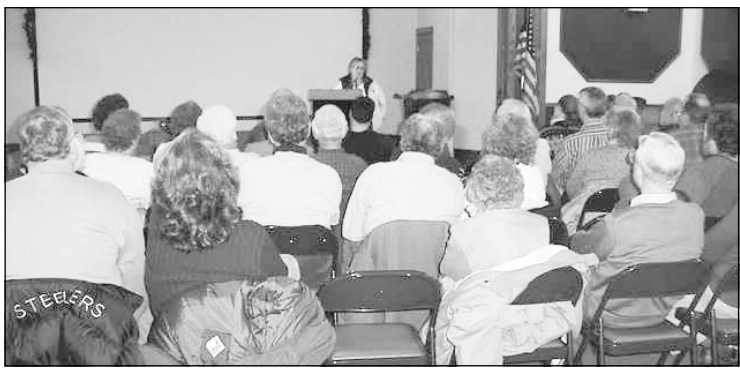
On a cold Friday evening, January 21, 2005, members and friends gathered in the Fulton Theater to hear stories of life in the past.

members were non-combatants but served as stretcherbearers and surgeon assistants when needed. They provided the music that kept men in step while on the march and maintained the morale of the troops. Samples of their music can be found on their new web page: www.geocities.com/cw46paband/index.html