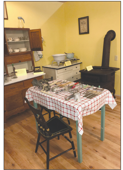
Two new displays at the Museum Annex included the Metz Jewelry Store, and a 1920s era kitchen.