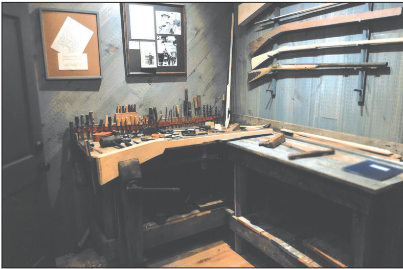
The new gunsmith display in the Museum Annex.