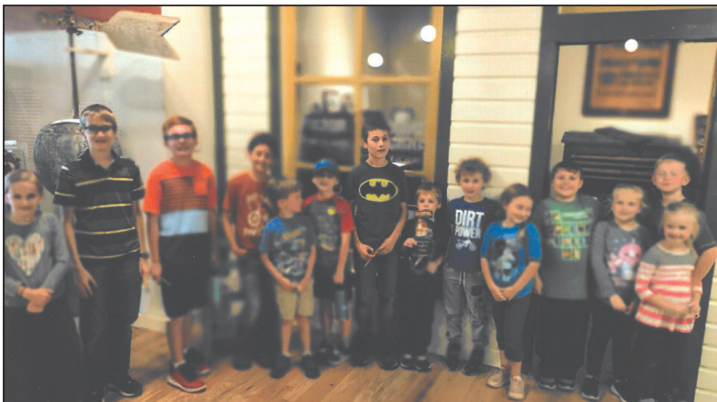
Homeschoolers tour the Museum Annex.

Throughout the summer on Fridays, the Fulton County Quilt Club worked on a quilt at the entrance of the museum, giving visitors a look into the art of hand quilting.