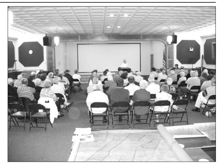
At the Society's fall meeting, 23 WW II veterans addressed an audience of about 80 in the Fulton Theater.

PO Box 115, McConnellsburg, PA 17233 Non-Profit 501(c)(3) organization #23-7453773