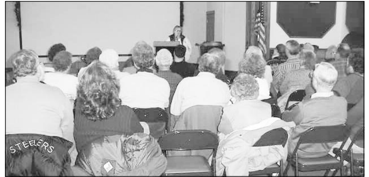
On a cold Friday evening, January 21, 2005, members and friends gathered in the Fulton Theater to hear stories of life in the past.

The 46th Pennsylvania Volunteer Infantry Regiment Band, a non-profit group of musicians from the Altoona area, will present an evening of music including military marches, field calls and folk songs following our meal on April 9 at the Sideling Hill Church. The program will include stories about the original men in this Civil War regiment. Band